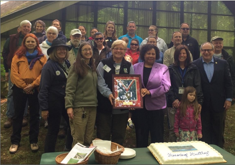
Ceremony attendees pose with the Governor's Environmental Excellence Award gold medal.

On the first Sunday in May Huntley Meadows Park hosts its yearly Wetlands Awareness Day. A day in which Staff, Volunteers, Friends of Huntley Meadows Park (FOHMP) and Friends of Historic Huntley (FOHH) Board Members, and FOHMP and FOHH members share with visitors the importance of wetlands and watersheds. This year over 800 people attended the event held on May 5, 2017. During the day a ceremony was held in recognition of Huntley Meadows Park's receipt of the Governor's Environmental Excellence Award (See front page for details). Attendees also learned about how the animals of Huntley are adapted to survive, saw live animals, got up close and personal with wetland clay, and enjoyed an informative and exciting day at the Park.